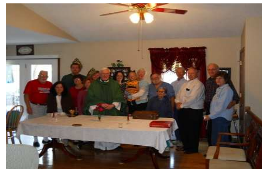
The Spirit of St. Louis TEC community celebrated their 5th anniversary with Mass, good food and camaraderie.